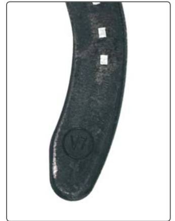
HIND OUTSIDE HEAL

Front shoe nail hole pattern 4+4; 4+3 or 3+3 with spare holes for difficult feet.