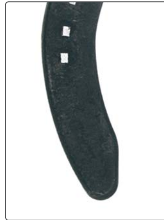
HIND INSIDE HEAL